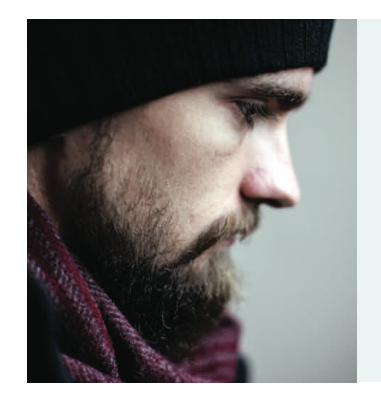
I was frightened about needing help, but I am so glad I made the call. I have freedom and feel ready for the future, more confident.

If so, your local Pregnancy Options Centre is here to help. We provide free , unbiased counselling for men and women for unplanned pregnancy, post abortion or miscarriage.